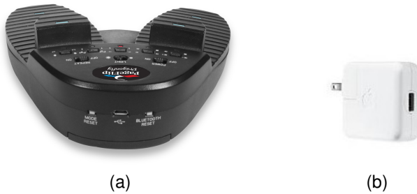
Figure 2: (a) Rear view of PageFlip Dragonfly. Attach the micro-USB end of the 6' USB cable into the rear micro-USB outlet and connect the other end into a computer USB port or (b) any USB AC adapter, such as those found on iPads and iPhones.

In addition to being battery-operated, PageFlip Dragonfly may also be powered by connecting it to a computer using the supplied USB cable (Fig. 1). Simply plug one end of the power cable into the micro-USB outlet on the rear of the PageFlip Firefly (Fig. 2(a)) and plug the other end into a computer's USB port. The pedal can also be plugged into the wall via a USB AC adapter (Fig. 2(b)), such as those included with cell phones or tablets.