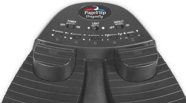
Figure 3: Top view of PageFlip Dragonfly control panel.