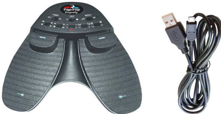
Figure 1: Package contents: PageFlip Dragonfly and USB cable.