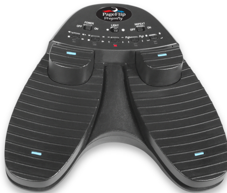
Figure 6: Primary (larger) and secondary (smaller) pedals. Each of these four pedals has an LED light that can be turned on for use in dim venues.